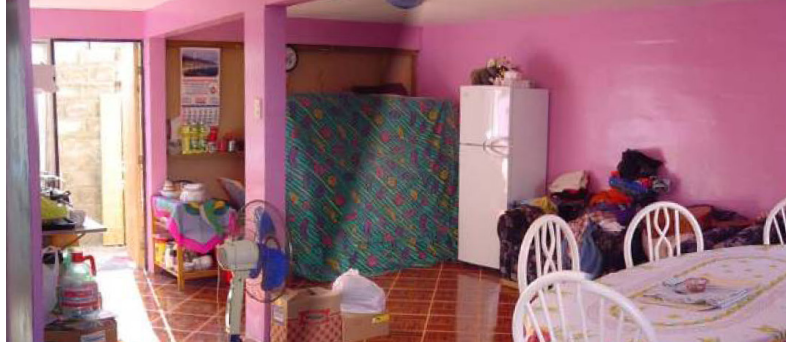
Fig. 3 Interior views of a unit in Quinta Monroy showing before (left) and after (right). Self-constructed modifications include windows, floor surfaces, and painting.