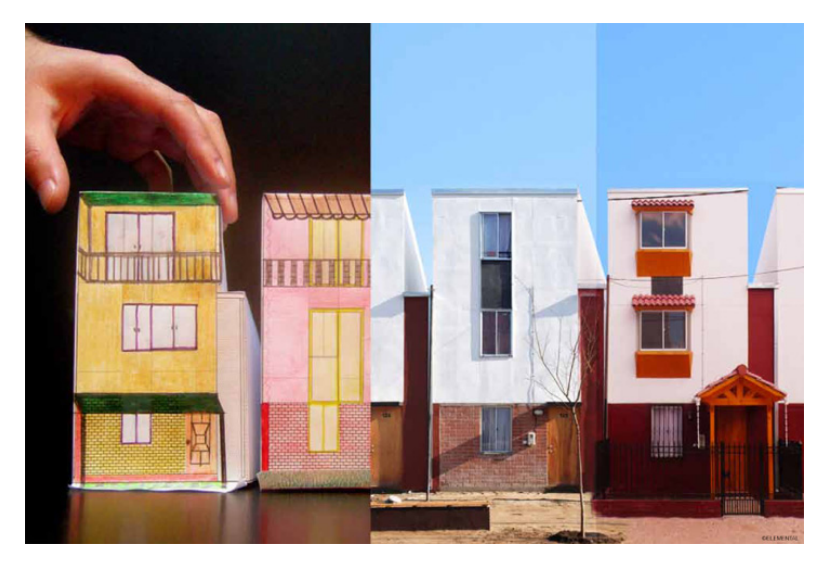
Fig. 2 Collage depicting three stages of development. Left: models used in a co-design session with future residents. Middle: completed construction. Right: after being lived in for some time, showing modifications by the residents.