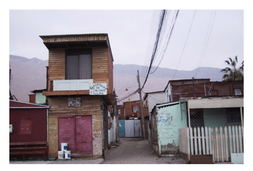
Fig. 1 Quinta Monroy, as seen here before Elemental's project, is representative of Chile's informal urban settlements.