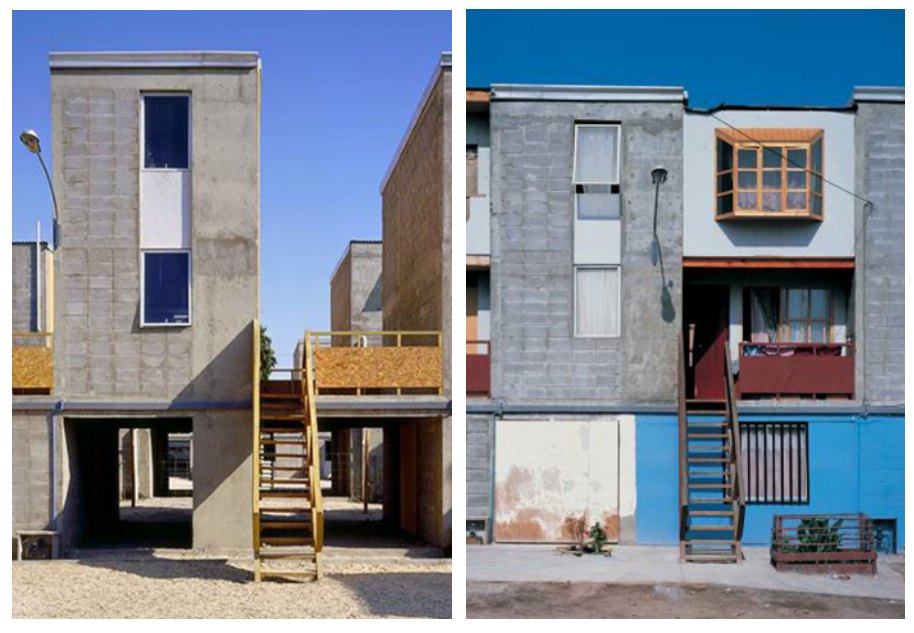
Fig. 5 Quinta Monroy as it appeared when construction was complete.