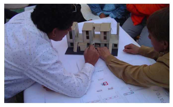
Fig. 4 Future owners were involved in the design process through a series of workshops. These sessions included the group making difficult choices about what to build now and what to leave for later. As construction began, the workshops focused on how the owners would be able to make best use of the new homes and expand them safely.